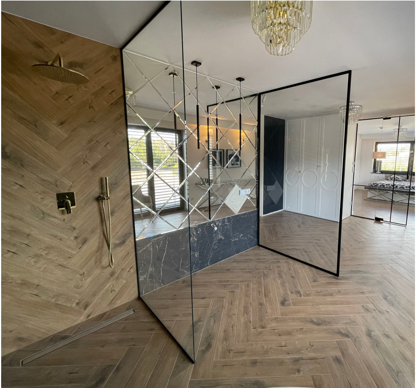
USE OF GLASS IN INTERIOR DESIGN