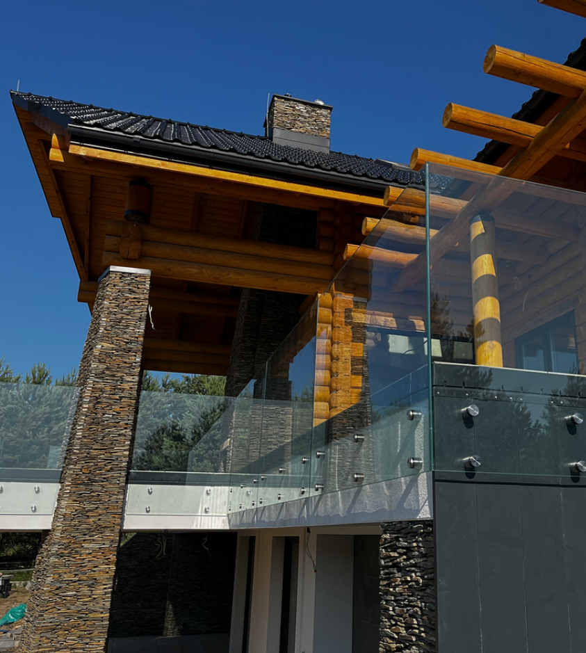
EXTERIOR ARRANGEMENTS Using glass elements for balustrades and glass roofs.