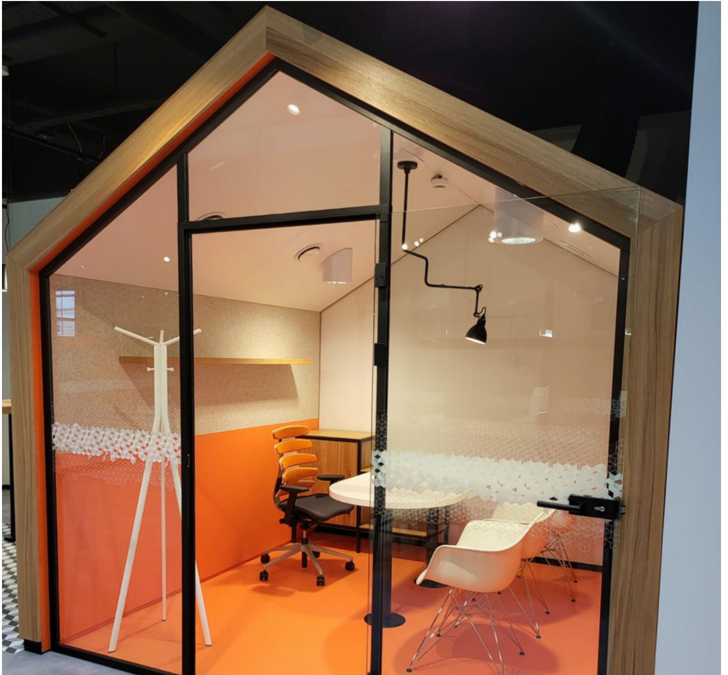
GLASS ELEMENTS IN BUSINESS INTERIORS